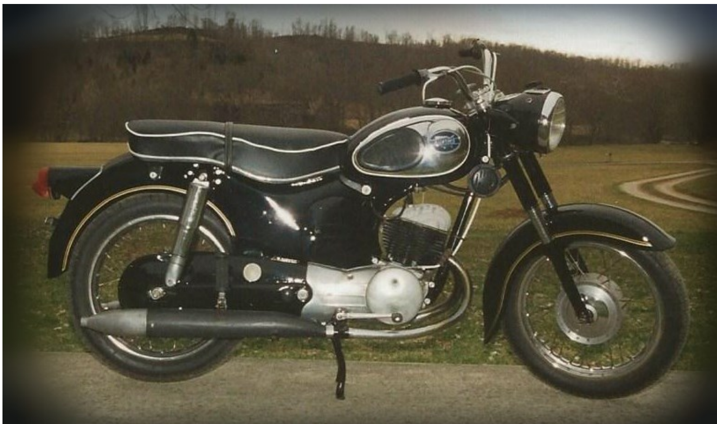
Bike Owned by Gary Claxon

Model Numbers 810.94160-810.84170, 810.94211